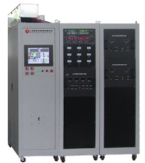
Electrical Enclosure 电控系统

① 上海市松江工业园区松卫北路819号 201613 819# Songwei Road(N), Songjiang Industrial Zone, Shanghai China, 201613 www.royal-source.com www.royaltec.com.cn service@royaltec.com.cn