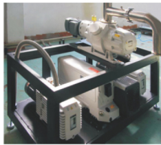
Roughing Pump Package 前级泵