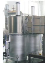
Oil Diffusion Pump 扩散泵