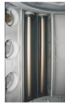
Arc + Rotary Target Sputtering 弧+柱靶