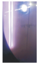
Arc + Sputtering Deposition 弧+ 溅射沉积镀膜